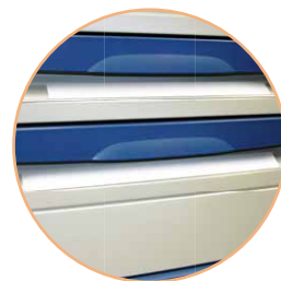
Drawer / Door Label Holders

This is a small selection of a large configurable range. Please contact our customer services team to discuss your requirements