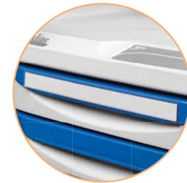
Drawer Label Holders

This is a small selection of a large configurable range. Please contact our customer services team to discuss your requirements