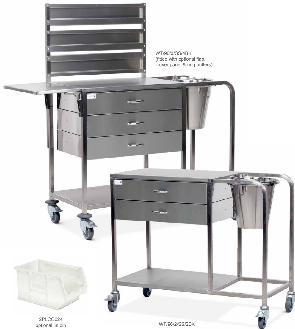
WT/96/3/SS/4BK (fitted with optional flap, louver panel & ring buffers)