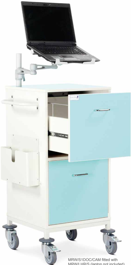
MRW/S1DOC/CAM fitted with MRW/LHR/S (laptop not included)