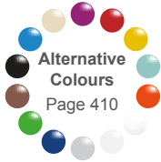
Alternative Colours Page 410