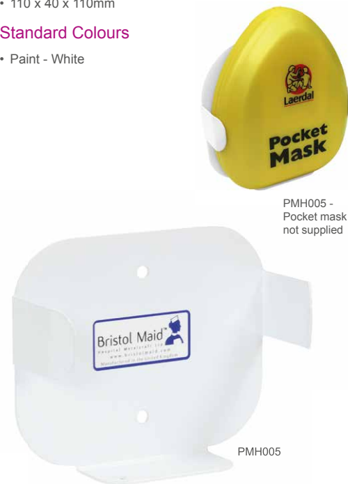
PMH005 - Pocket mask not supplied