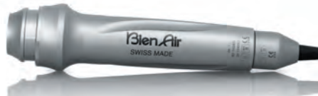
1700500-001 PM PERFO with cable