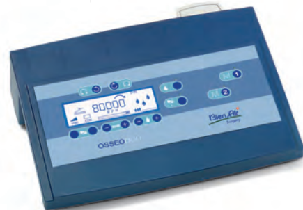
OSSEODUO 1700523-001 / Drill RAPIDO 1700524-001 / Drill NANO