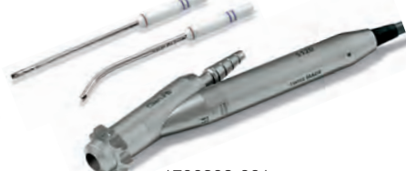
1700302-001 S120 with cable