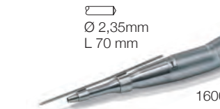
Ø 2,35mm L 70 mm