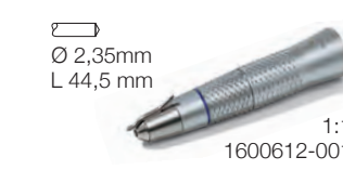
Ø 2,35mm L 44,5 mm