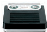
OSSEOSTAP 1700331-001 8 x LR6 /AA batteries