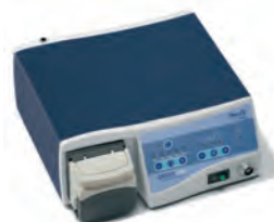
OSSEOUNO 1700300-001 / Shaver S120