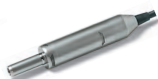
1700263-001 80K with cable