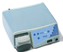
OSSEODOC 1700525-001 / BASCH-1 with pump 1700168-001 / BASCH with pump 1700169-001 / BASCH without pump