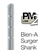
PM2 LINE Bien-Air Surgery Shank