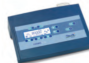
OSSEODUO 1700521-001 / S120 + RAPIDO 1700522-001 / S120 + NANO 1700523-001 / Drill RAPIDO 1700524-001 / Drill NANO 1700249-001 / S120 + 80K 1700250-001 / Shaver S120 1700251-001 / Drill 80K