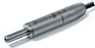
1700074-001 BASCH with cable