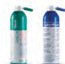
1600617-006 Aquacare 1600064-006 Lubrifluid